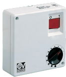
C 1.5 (COMANDO EL. 1.5 A) Code 12966