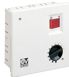
SCNRB I Code 12971