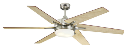
Reversible Light Maple Finish Blades